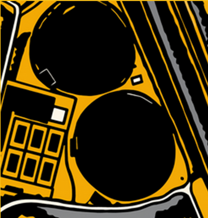
FARMER ST, BARINGA